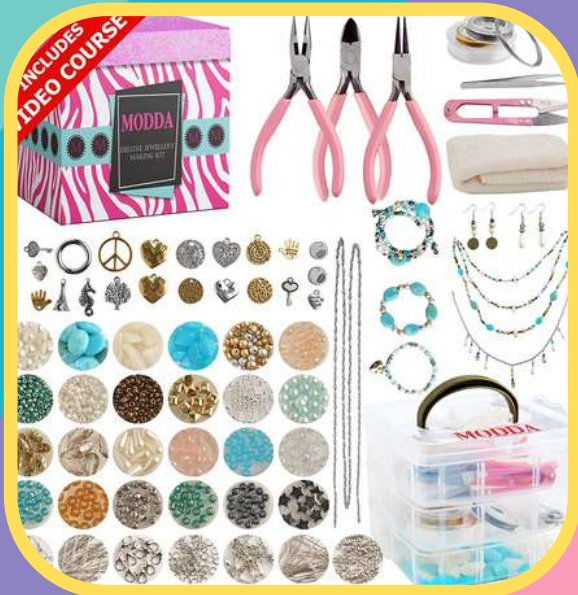
Modda Deluxe Jewelry Making Kit