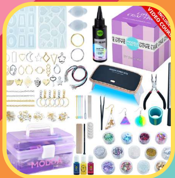
Modda UV Resin Jewelry Making Kit

Did You See Our Other Hobby Kits with FREE Video Course Included?