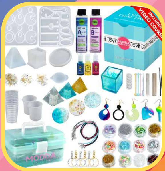
Modda Epoxy Resin Making kit