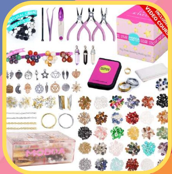
Modda Natural Stone Jewelry Making Kit